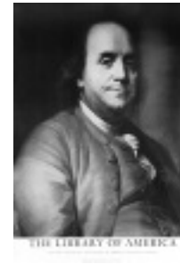
Benjamin Franklin B&W 24" x 35" _____ @ $10.00 (POSTER5)