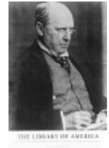
Henry James B&W 24" x 35" _____ @ $10.00 (POSTER7)