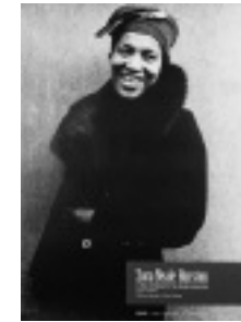
Zora Neale Hurston 2-color 19½" x 27" _____ @ $10.00 (POSTER6)