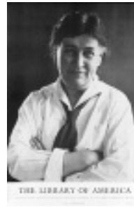
Willa Cather B&W 24" x 35" _____ @ $10.00 (POSTER4)