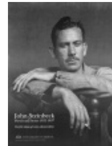
John Steinbeck B&W 24" x 31" _____ @ $10.00 (POSTER10)