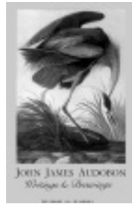
John James Audubon 4-color 16" x 24" _____ @ $10.00 (POSTER3)

Select the posters you would like to order by marking the quantity next to each.