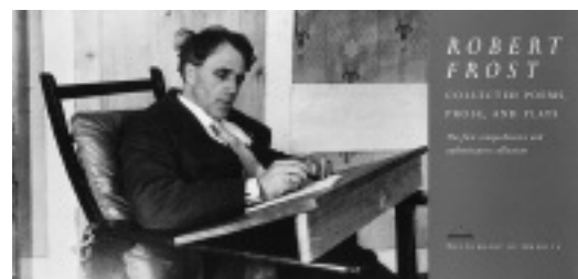
Robert Frost 2-color 32" x 15½" _____ @ $10.00 (POSTER1)