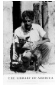
Eugene O'Neill B&W 24" x 36" _____ @ $10.00 (POSTER9)