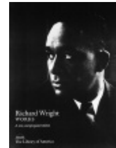
Richard Wright B&W 19½" x 26" _____ @ $10.00 (POSTER12)