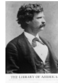
Mark Twain B&W 24" x 35" _____ @ $10.00 (POSTER11)