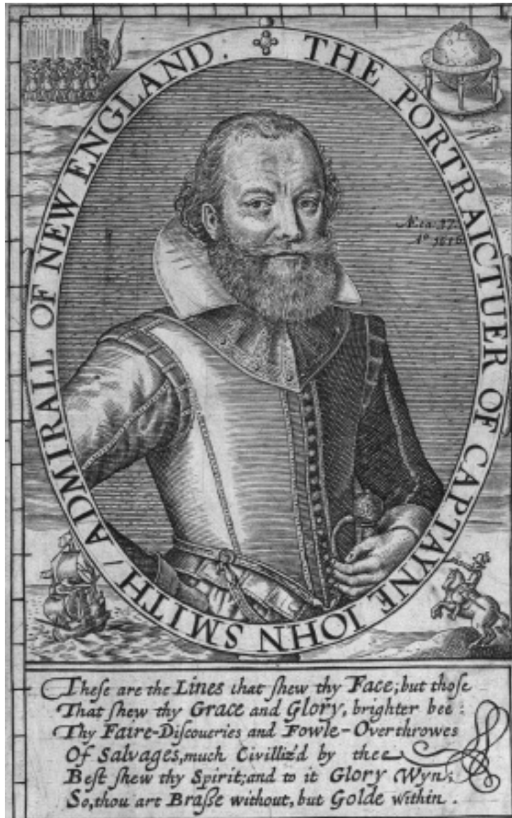
1. Simon van de Passe, The Portraituer of Captayne John Smith (1617)