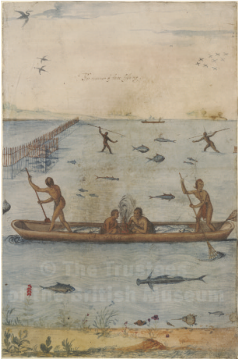
25. The manner of their fishing