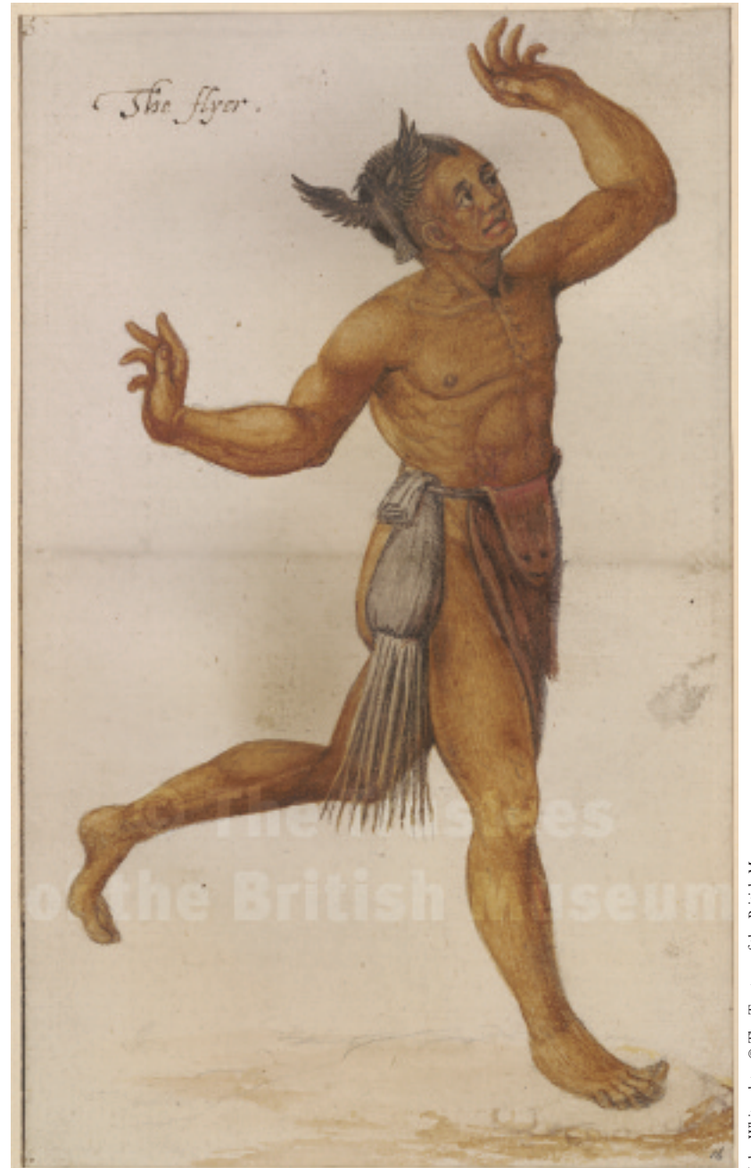
29. The flyer